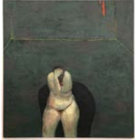
Self-Portrait 7 , 2004 Oil on wood 64 x 60 inches 162.6 x 152.4 cm BG 19977