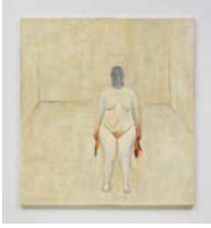
Self-Portrait 4 , 1994 Oil on panel 64 x 60 inches 162.6 x 152.4 cm BG 17865