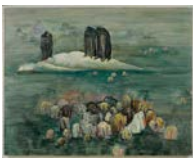
Self-Portrait 17 , 2005 Oil on canvas 68 x 84 inches 172.7 x 213.4 cm BG 19979