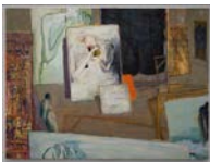
Self-Portrait 20 , 2005 Oil on wood 48 x 64 inches 121.9 x 162.6 cm BG 19980