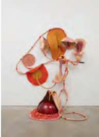
Untitled, 2021 Straw, ropes, beads, ceramic, resin 78 3/4 x 70 7/8 x 39 3/8 inches 200 x 180 x 100 cm MN 19967