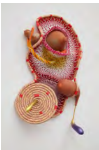
Untitled, 2021 Beads, ceramic, resin 39 3/8 x 23 5/8 x 11 3/4 inches 100 x 60 x 30 cm MN 19966