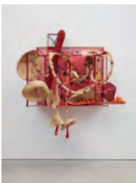
Out of the window 2, 2021 Straw, beads, clay, paper, wood, glass, iron 80 3/4 x 65 x 32 1/4 inches 205 x 165 x 82 cm MN 19963